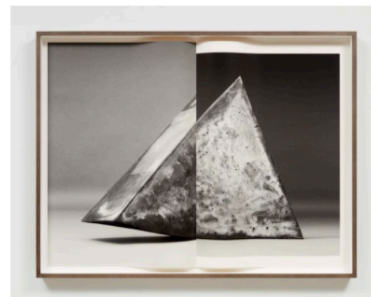
“Remainders,” at the Clark Art Institute, recalls the over-photographed works of the mid-20th century.