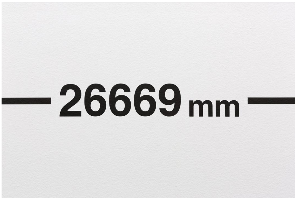
Mel Bochner "Measurement Room: Perimeter, 1968" at Fine Arts, Sydney, 2018