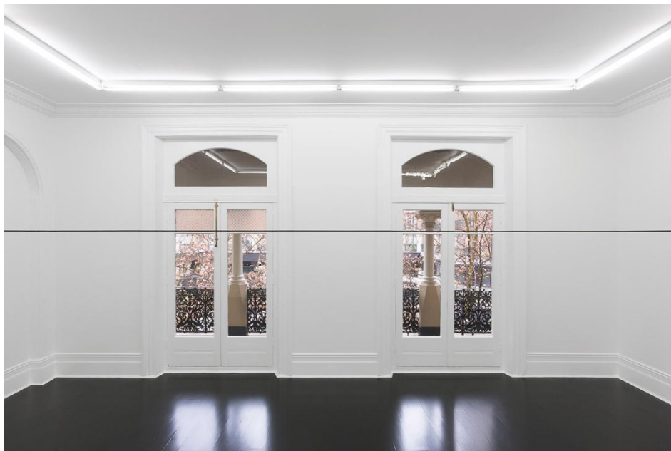
Mel Bochner "Measurement Room: Perimeter, 1968" at Fine Arts, Sydney, 2018