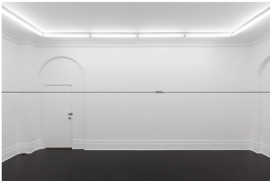
Mel Bochner "Measurement Room: Perimeter, 1968" at Fine Arts, Sydney, 2018