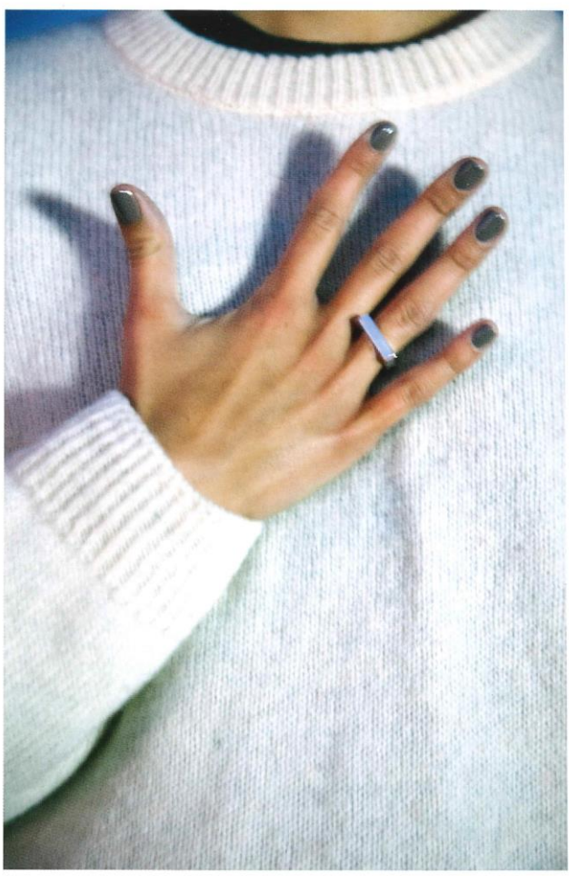
Für Mich from These Are Just Things I Say, They Are Not My Opinions (2014) (Arnolfini, Bristol)

For example, the series of photographs featuring hands that I made were inspired in part from my times on entrance examination commissions. I don't think it's betraying the privacy of candidates for the art school where I work if I say that, often, when the commission asks 'why do you want to study art?', the candidate responds with, 'I want to do it for me', and in some cases,