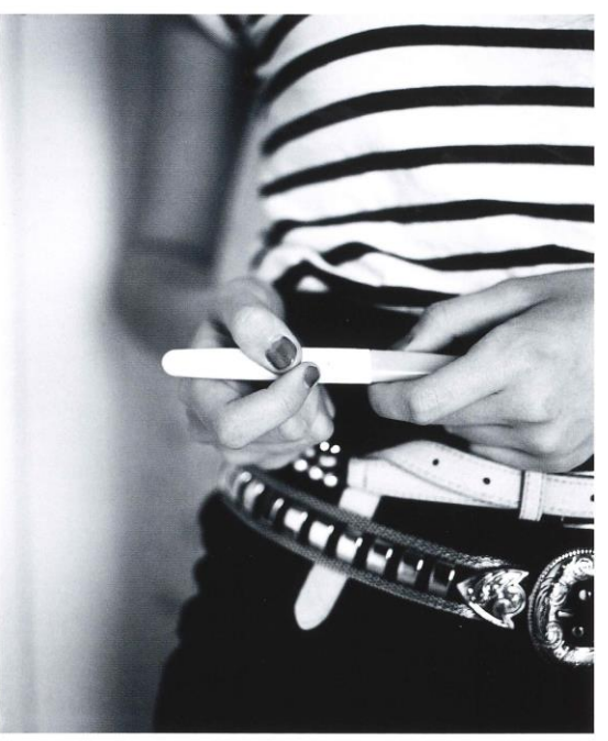
Conception XI from Embryos and Estate Agents: L'Art de Vivre (2011) (Chisenhale Gallery, London)

JP: Yes. It was another show with two main elements. I have known for a while that I wanted to use images of these carvings at some point. Starting with what are known as 'cup and ring' markings. They appear on rocks in different parts of Europe, and I think possibly, further afield. Broadly speaking, parts of Europe where Celts