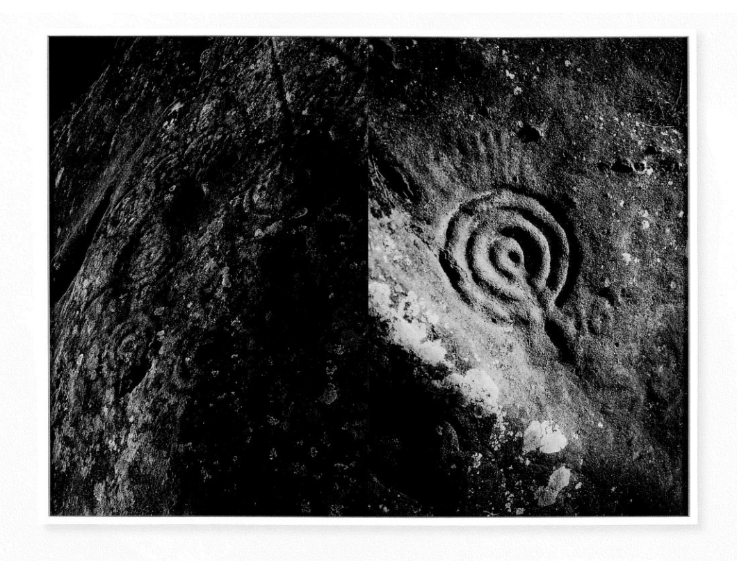
Cup and Ring 3 from In Case My Mind is Changing (2018) (Simon Lee Gallery, London)

of disembodied eye. The very simple software a colleague at the art school kindly set me off on uses the word 'camera' in the dropdown menu. I mean, this is probably laughably simplistic of me, but I think of the 3D prints as lens-based in a way, because of the role of the camera in their constitution. A camera freed from a body/operator.