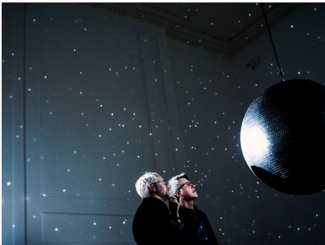
Katie Paterson, Totality , 2016. Installation view Somerset House.

21 Jan – 7 May 2017 at Towner Art Gallery in Eastbourne, United Kingdom