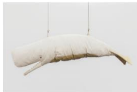
Leviathan II , 2013, canvas, leather, metal loops, wood, coconut fiber, and cord, 60 x 240 x 50 cm.