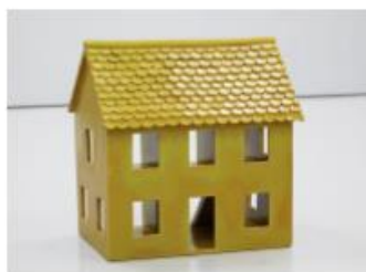
Installation view of A Magnetizer , 2019, glazed ceramic, 63 x 63 x 42 cm, at "The Blazing World," Spike Island, Bristol, 2019.

The witch as a figure of the night, and, by association, alterity, is encapsulated in Mirror Logic (2019), a tapestry hung at the far end of the exhibition hall with multicolored circles abstracting lunar positions, while conjuring the etymological connection between "menstruation" and the Greek "mene," meaning moon. It was paired with a trapezoid-shaped mound, based on the kogetsudai (moon-viewing platform) of Zen gardens, which are designed to reflect moonrays.