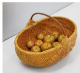
Installation view of Abnormally avid , 2019, glazed ceramic, copper wire, and plastic, basket: 35 x 48 x 36 cm and 14 apples: between 5–9 cm each, at "The Blazing World," Spike Island, Bristol, 2019. Photo by Stuart Whipp. Courtesy the artist and Simon Lee Gallery, Hong Kong / London / New York.

The gallery became a stage for the performance The Blazing World (2019), in which dancers, donning animal masks, enacted ecstatic rites reminiscent of legendary sabbath gatherings, further elaborating on the convergence of woman with other. "Doing all this research," Perret told me, "one of the things that always came up was the proximity between the witch and the animals. [According to folklore,] witches were transformed into animals during sabbath. The judges that were persecuting the witches would also turn them into beasts. Basically, they were women but were not really human. The animal masks represent this transformation."