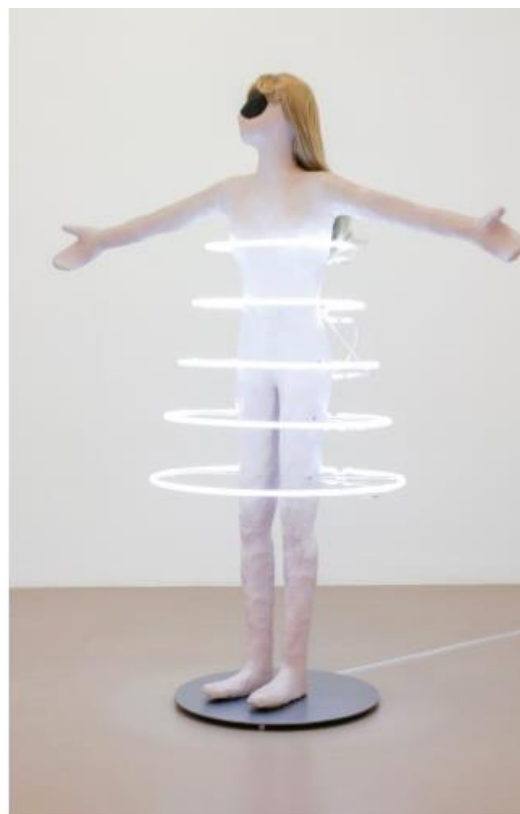
Apocalypse Ballet (Neon Dress) , 2006, figure in steel, wire, papier-mâché, acrylic, gouache, wig, five white neon rings, steel base, 175×160×160 cm.