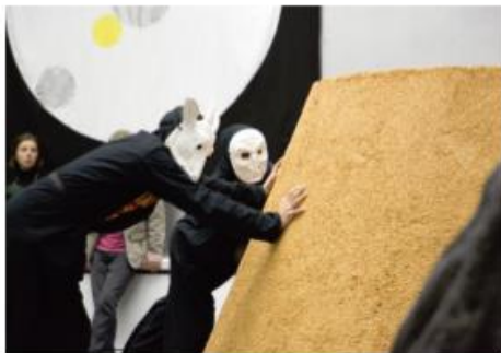
Photo documentation of The Blazing World , 2019, performance at Badischer Kunstverein, Karlsruhe, 2019.