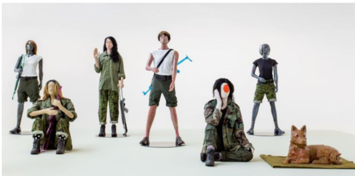
Installation view of Les Guérillères , 2016, mixed-media sculptures, dimensions variable, at "Féminaire," David Kordansky Gallery, Los Angeles, 2017.

This comes through in Les Guérillères (2016). Comprising a ceramic dog and mixed-media sculptures of women outfitted