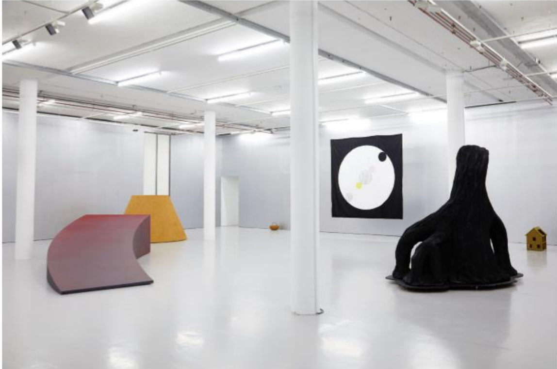
Installation view of "The Blazing World," at Spike Island, Bristol, 2019. Photo by Stuart Whipps. Courtesy the artist and Simon Lee Gallery, Hong Kong / London / New York.