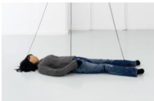
Installation view of La Fée Idéologie , 2004, mixed-media sculpture, dimensions variable, at "Yvonne Rainer Project," Centre d'art contemporain de La Ferme du buisson, Marnes-la-Vallée, 2014.