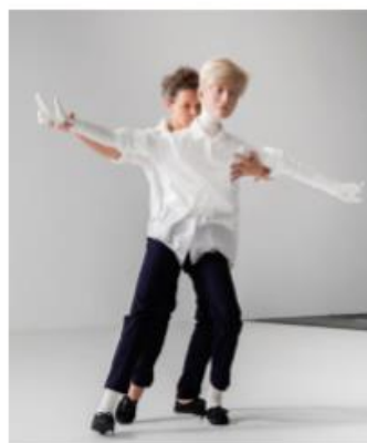
Photo of the performance Figures, 2014, at Biennale de l'Image en Mouvement, Centre d'Art Contemporain, Geneva, 2014.