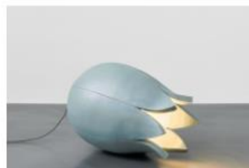
Installation view of The lantern's gone out! The lantern's gone out! I , 2019, glazed ceramic, 72×48 cm, at "News from Nowhere," Simon Lee Gallery, Hong Kong, 2020.