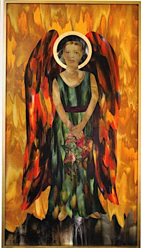
above (left) Night Whispers Collage on panel 36" x 66" x 2.5" 2016 Photo by LeeAnn Nickel Courtesy of the artist and Gavlek Los Angeles