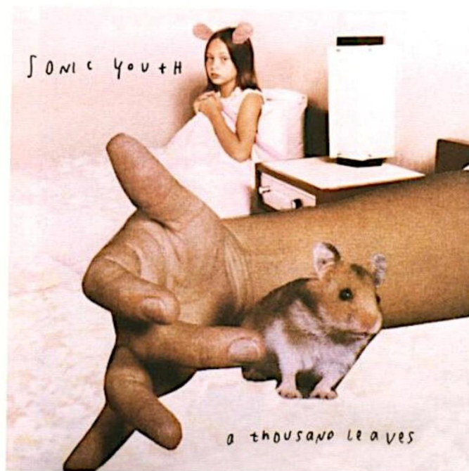
Below: Hamster Girl (Sonic Youth's A Thousand Leaves cover) Paper collage 1995 Courtesy of the artist

Oh, no. I've always had this attraction to clowns. As a kid, for some reason, I'd run to a clown before a normal person. That's just the way I am. I like all clowns: evil clowns, hobo clowns, lame clowns. When I was a little girl, I loved to watch Red Skelton as a clown on TV. My mother told me that I'd get right up to the screen and I'd say, "poor him," and I'd cry, 'cause he always had empty pockets. So she'd have to turn off the TV. It's kind of a release of pain to witness the humiliation of a clown. I got into hobo clowns when I found out that my grandmother would feed the hobos by the train track. Emmett Kelly was actually making a political statement as his hobo character, not only to make people laugh, but also to