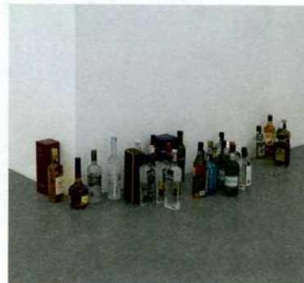
This page: May 2010 exhibition list of the of Known to Few , Unknown to Fewer at Simon Lee Gallery, London. Left: Poster Sculpture , 2010, 3000 bound posters 100 x 70 x 54 cm, 39 3/8 x 27 1/2 x 21 1/4 in. © The Artist; Liquor Sculpture , 2010, 32 Liquor Bottles, dimensions variable. © The Artist, Courtesy Simon Lee Gallery, London. All works by Matias Faldbakken, images Courtesy Simon Lee Gallery, London