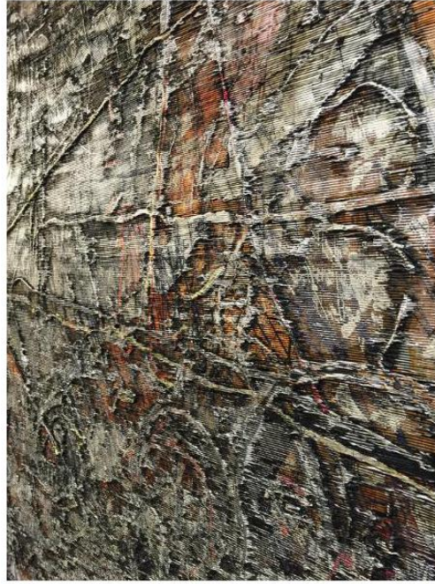
Garth Weiser - 5, detail, 2016